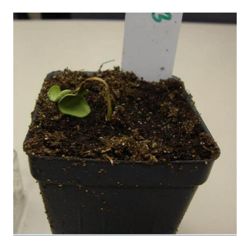
Figure 4. Typical reaction in Fon pathogenicity testing