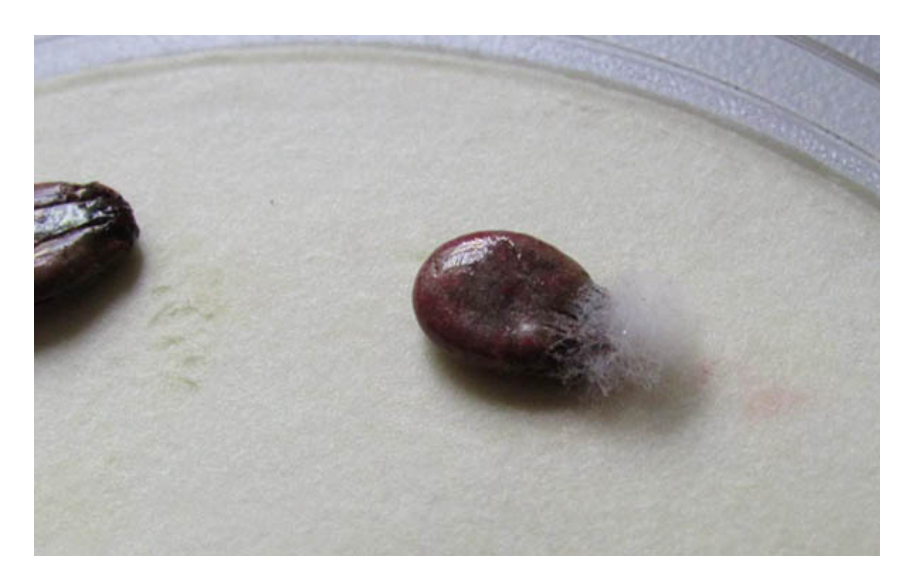
Figure 1. Fon suspect seed.